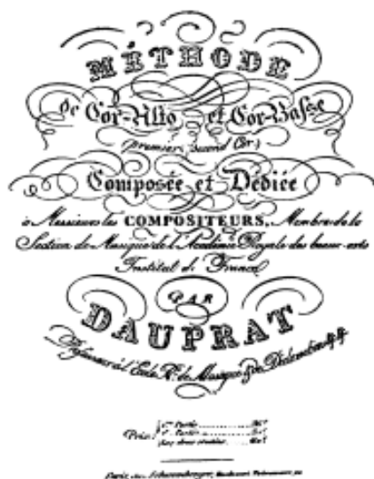
Figure 2 – Méthode de Louis François Dauprat

Meifred, a winner of the premier prix as a cor-basse at the Conservatoire in 1818, was drawn to the valved horn shortly after its arrival in France in the mid-1820s 2 . Meifred's early work with this instrument included several firsts, including: