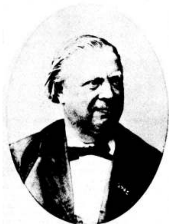
Figure 6 - Jean Baptiste Victor Mohr

the Conservatoire, Mohr also created his own method, Méthode de premier et de second cor (Paris: Escudier, 1869), devoted exclusively to natural horn.