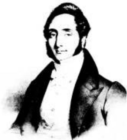
Figure 4 - Jacques François Gallyay