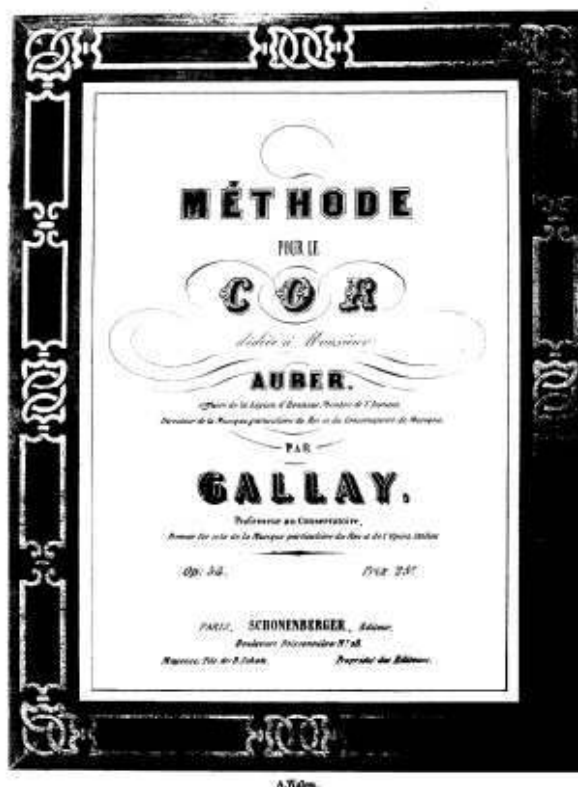
Figure 5 – Méthode de Gallyay

What is most telling in his Méthode , however, is that Gallyay would not go so far as even to acknowledge the existence of a valved horn. In fact, he shows a clear bias for the natural horn: