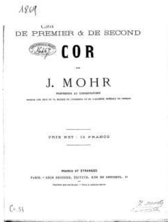
Figure 7 – Méthode de J. Mohr

During this time, Fétis and others continued to try to rally support for what they saw as progress, asserting that valves were among the most important discoveries ever offered to composers, and that France was « toujours en retard » to other countries which had moved forward by adopting valved horns, trumpets, trombones, and substituting bass and contrabass saxhorns for ophicleides. In one article, Fétis suggested this « prejudice » had also affected composers—they either sympathized with the musicians or catered to their egos so their works would be performed properly, if at all, naming Mohr as one of the influential players affecting composer's choices. An example Fétis presented was Meyerbeer's L'Africaine which includes two valved and two natural horn parts « so as to not hurt their feelings ». For horns, he further noted that the argument of desirable timbre of the natural horn was no longer defensible, since one could get the same effects with valves over a wider range, recalling Meifred's technique. In the end, Fétis was convinced that makers such as Adolphe Sax had raised the level of valved instruments to a point where they should no longer be excluded 11 .