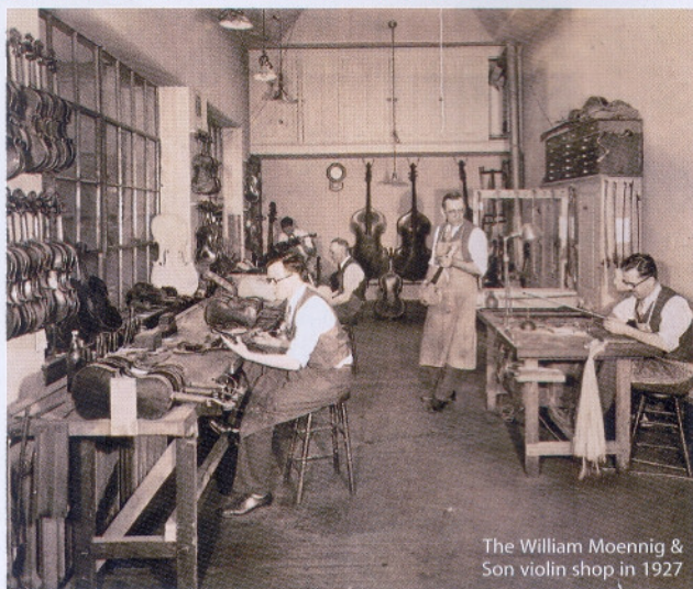
The William Moennig & Son violin shop in 1927